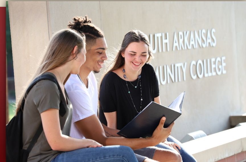
Student-to-faculty Ratio (2018)

Despite the high percentage of part-time faculty, the majority of instruction at SouthArk is by full-time faculty.